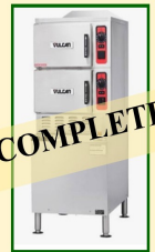
RETIRE THE MORTGAGE